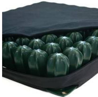
Cushion and Cover